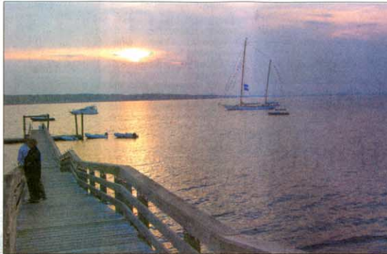
The star of the evening was really Narragansett Bay, for which the fundraiser was held. The view from Carnegie Abbey was as beautiful as that from any island anywhere, a fine reason to support Save The Bay.